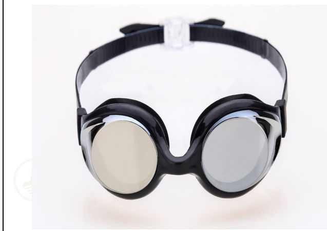
Style No.: L011336