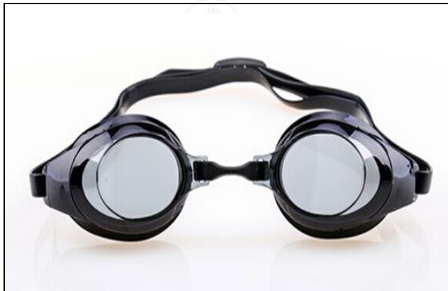
Style No.: L021452