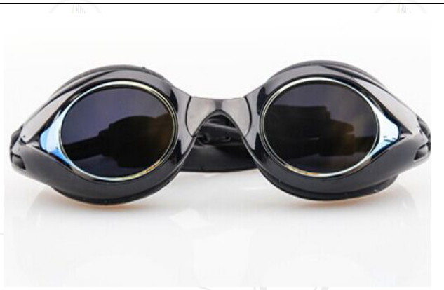
Style No.: L031007