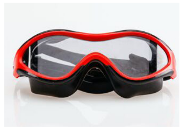
Style No.: L011457