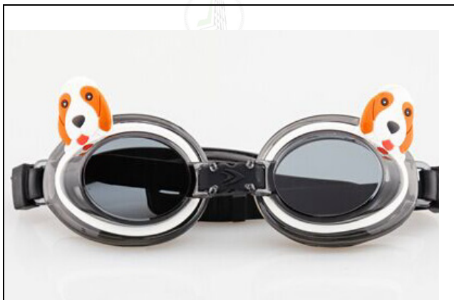
Style No.: L041016